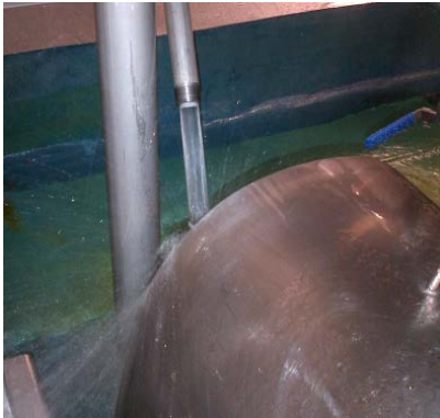
Before –Cooling water going to drain

Arla replaced jacketed tank that used chilled water pass through and straight to the drain with an air-cooled system that does not use water. This alternative resulted in more water savings, since the cooling system does not use water. Savings were found to be 17,472 m 3 /year of municipal water (100% reduction of water used or a 13.6% reduction in Arla's overall municipal water consumption)