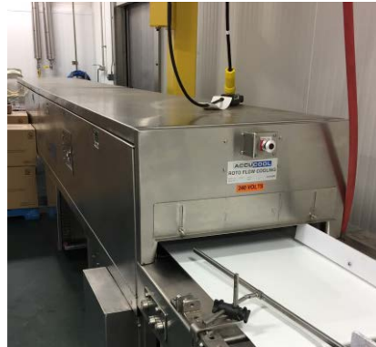
After – New air-cooled system