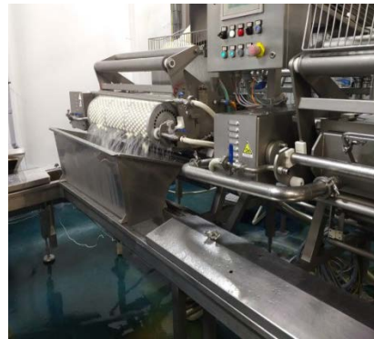
After – Capture cheese and water