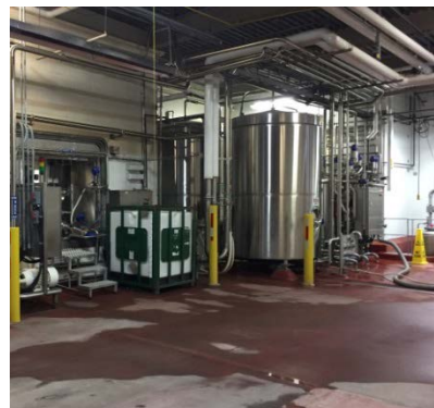
After – New CIP system