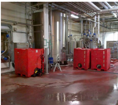
Before –Old CIP system

Arla started recovering the acid portion of the raw CIP cycle, saving water and acid, and has reduced washing times for tanker trucks. The overall savings associated with this opportunity are estimated to be 2,220 m 3 /year of municipal water (70% of the water used for these purposes, or a 2% reduction in Arla's overall municipal water consumption). Savings were calculated based on the previous truck washing procedure (500 LPM for 300 seconds, twice daily), reported previous consumption of 900 L for each of eight daily acid washes, and assumes the system recovers 70% of the water.