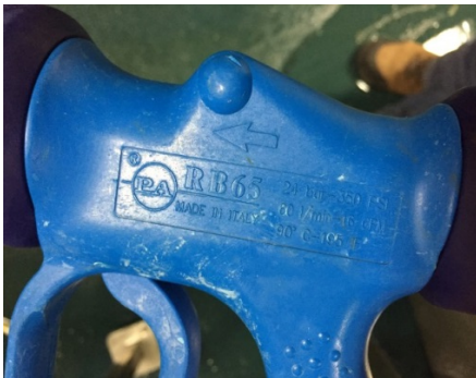
Before –Old spray gun(32.5 at 80 psi)

Water savings associated with this opportunity were calculated based on the flow rates of the new and old spray guns and the operating hours reported by Arla staff. Water savings associated with this opportunity were verified to be 437 m 3 annually (4% of the water used by the spray guns, or 0.3% of Arla's overall municipal water consumption).